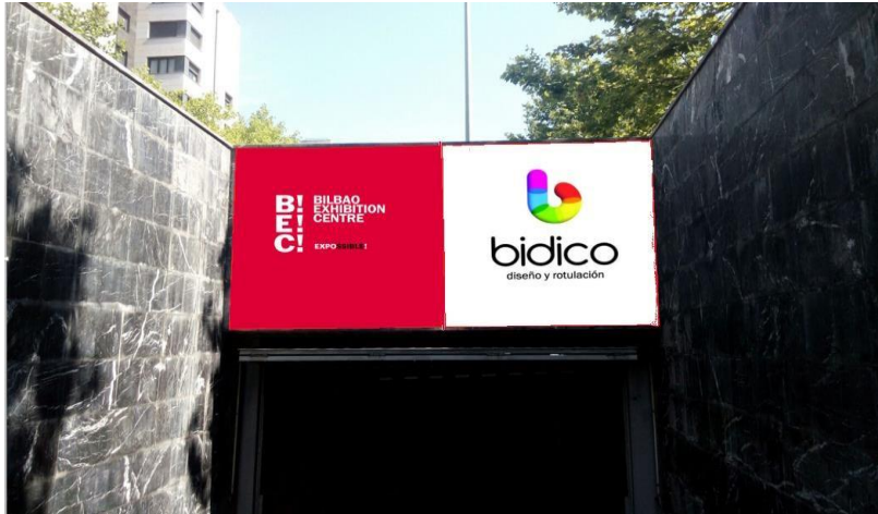
Image over the car park access door

Showcase your brand to visitors arriving at the venue in their private cars. Upon entrance to the car park tunnel, your brand will be showcased on a very large sign.