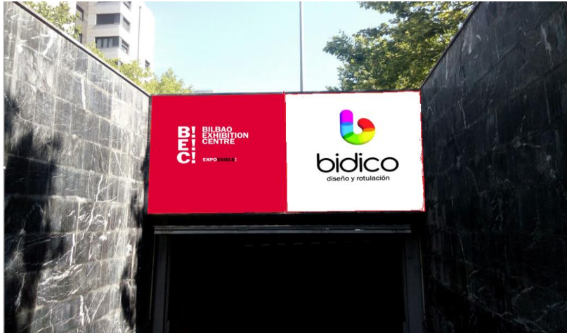
Image over the car park access door

Showcase your brand to visitors arriving at the venue in their private cars. Upon entrance to the car park tunnel, your brand will be showcased on a very large sign.