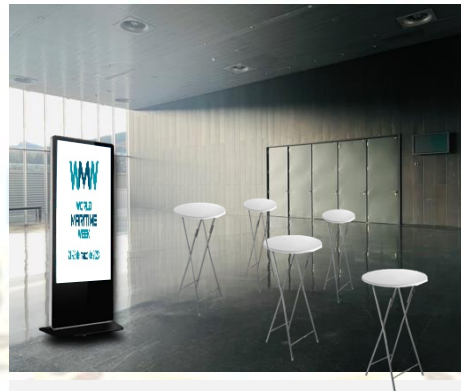
Logo on cardboard stand in the cocktail area (totem)