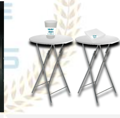
Logo on glasses and napkins (optional, additional production cost)